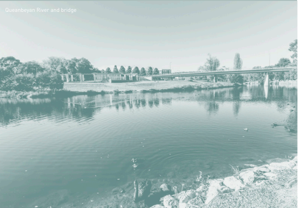
Queanbeyan River and bridge