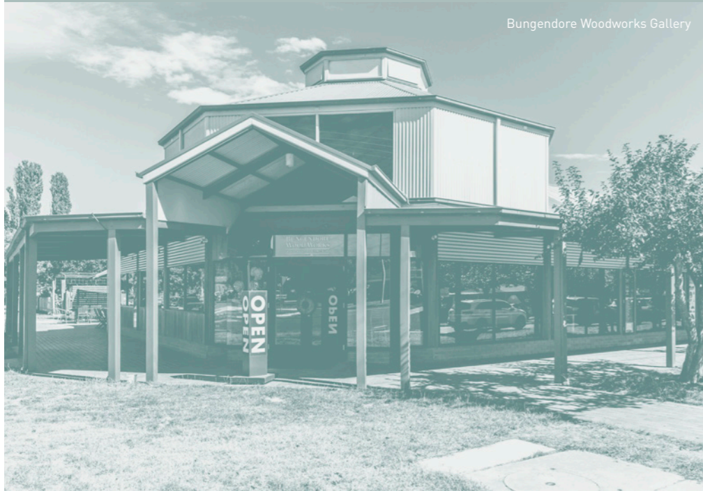
Bungendore Woodworks Gallery