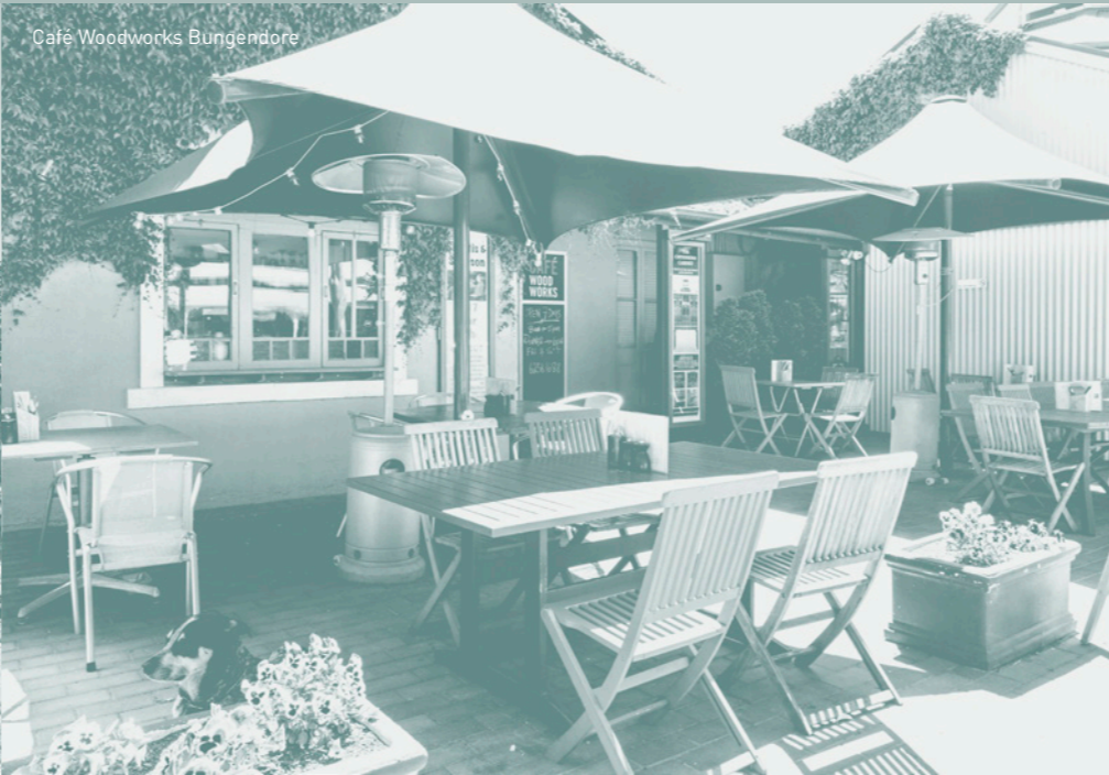
Café Woodworks Bungendore